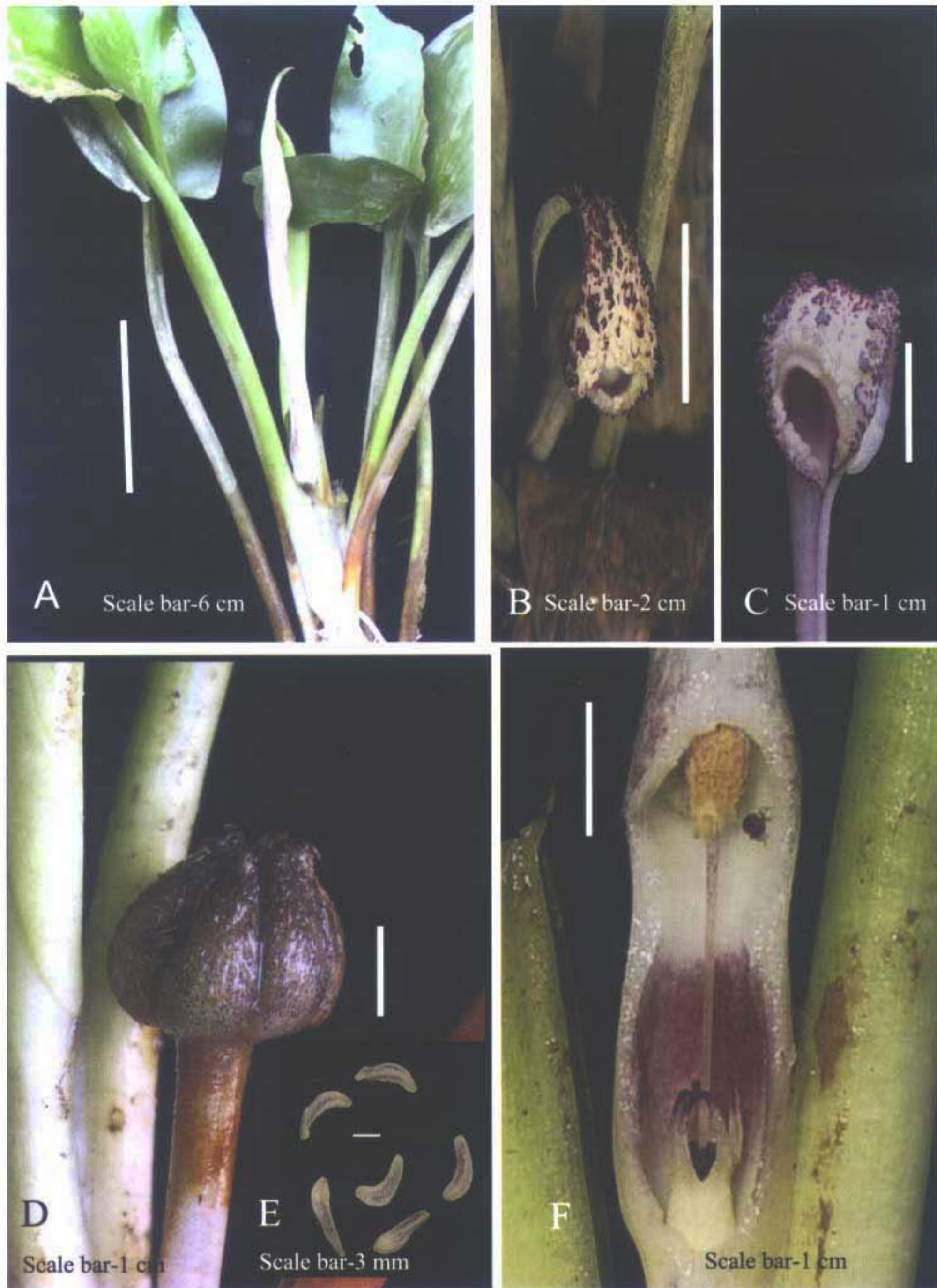
Plate 1. Cryptocoryne zaidiana Ipor & Tawan. A Plant with unopened inflorescence; B, C limb surface and collar; D syncarp with verrucose surface; E seeds; F the male and the female zones.